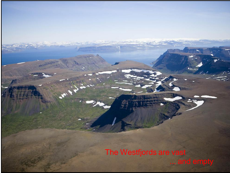
The Westfjords are vast ... and empty